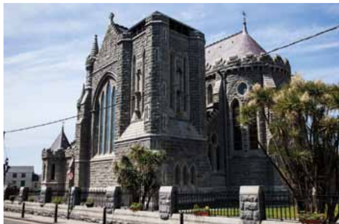
The O'Connell Memorial Church